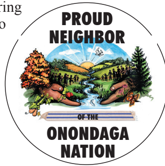
Buttons available for $1.50 from Neighbors of the Onondaga Nation.

The Onondagas have made their move. It's up to us to do our part to change the priorities of our state and nation from short-sighted protection of corporate profit to care for the quality of human life, now and in the generations to follow.